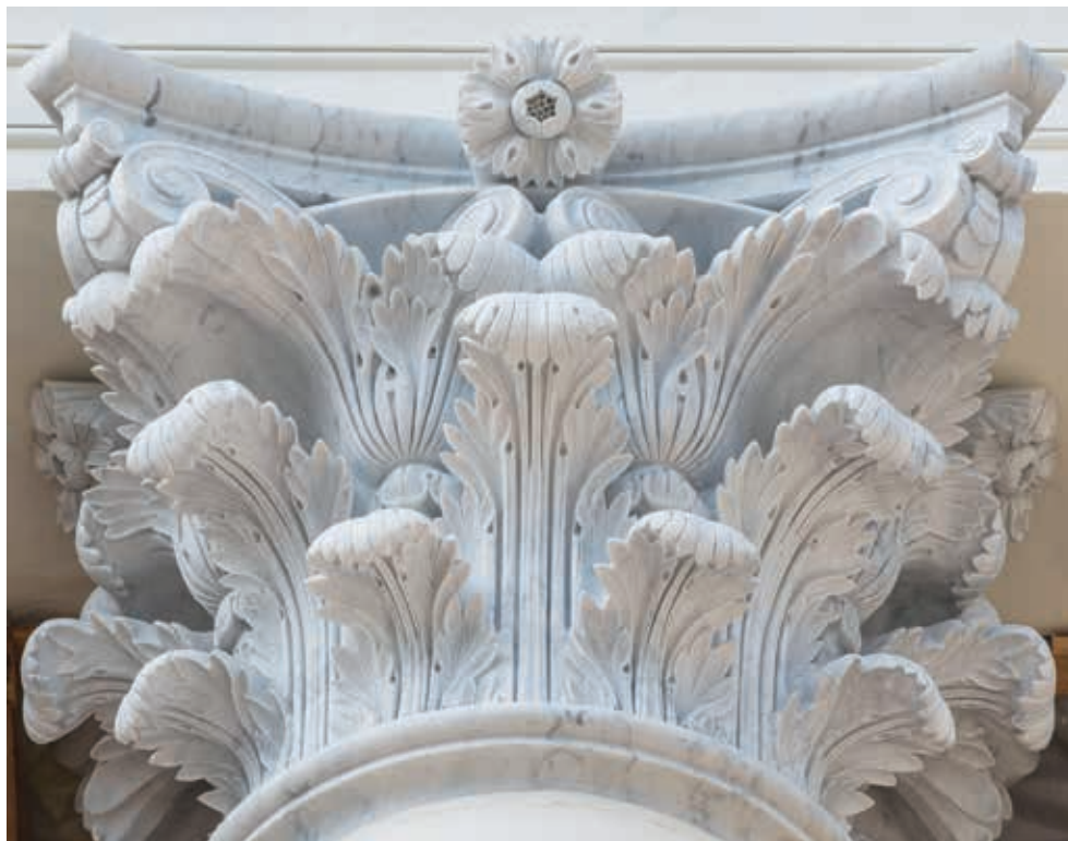
The finished product is a stunning replication of the original columns from the 1820s.

Stone Supplier/Installer: Rugo Stone, LLC, Lorton, VA (Carrara C marble from Campanili Quarry in Carrara, Italy)