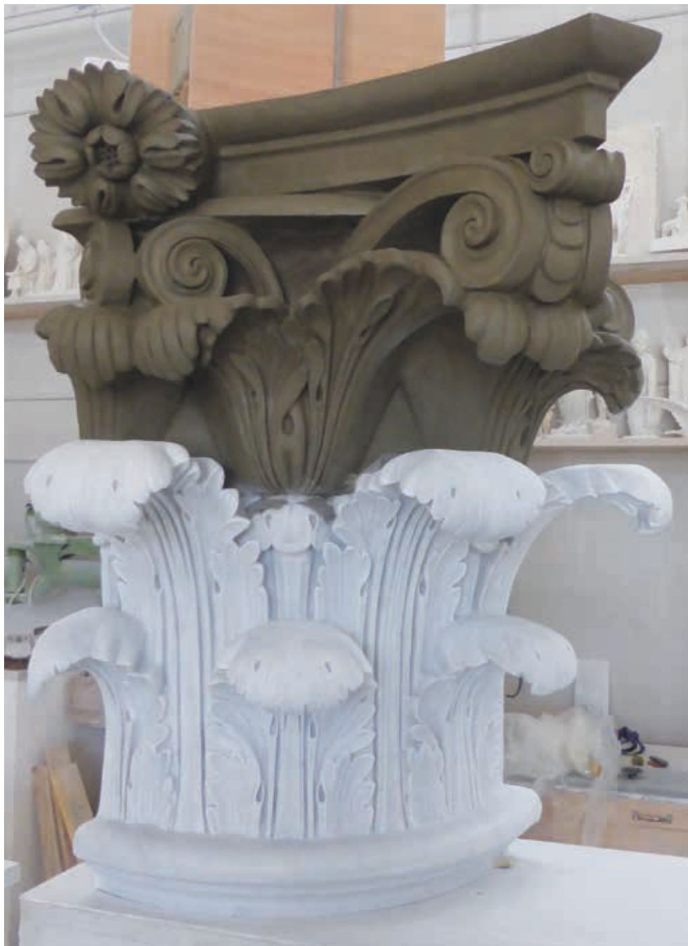
After the model was crafted, a two-dimensional hand drawing was completed to detail all the ornament on Corinthian capitals, followed by the development of a full-round three-dimensional digital shop drawing. Lastly, three-dimensional full-round CAD files were used to CNC route solid blocks up to 80% complete, leading to the careful hand carving of 16 full round capitals, which each weigh 6,300 pounds and measure 4' 8" x 4' 8" x 3' 10."

JGWA paid careful attention to the history of the building and renovated it to reflect what the original plans included. "When Jefferson originally designed the rotunda, there was a gymnasium behind a wall," said