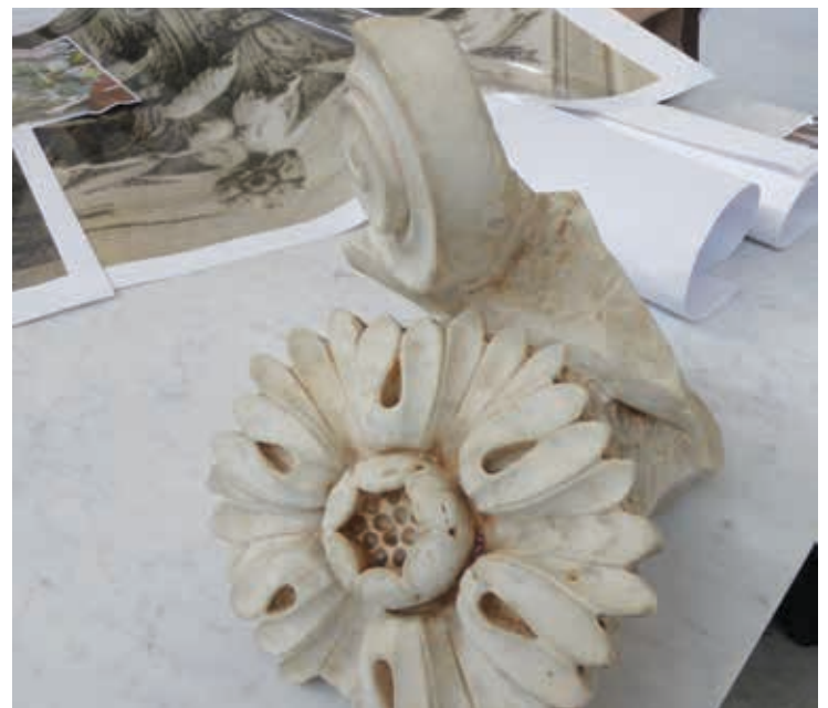
Since an 1895 fire destroyed the majority of the building, the architects and stone fabricators only had partial columns and fragments to work off of, as well as a couple of old photos. To begin, three-dimensional digital scans of a capital base and three smaller upper capital fragments of existing 1823 capitals were taken, creating a one-quarter-round composite marble and clay model.