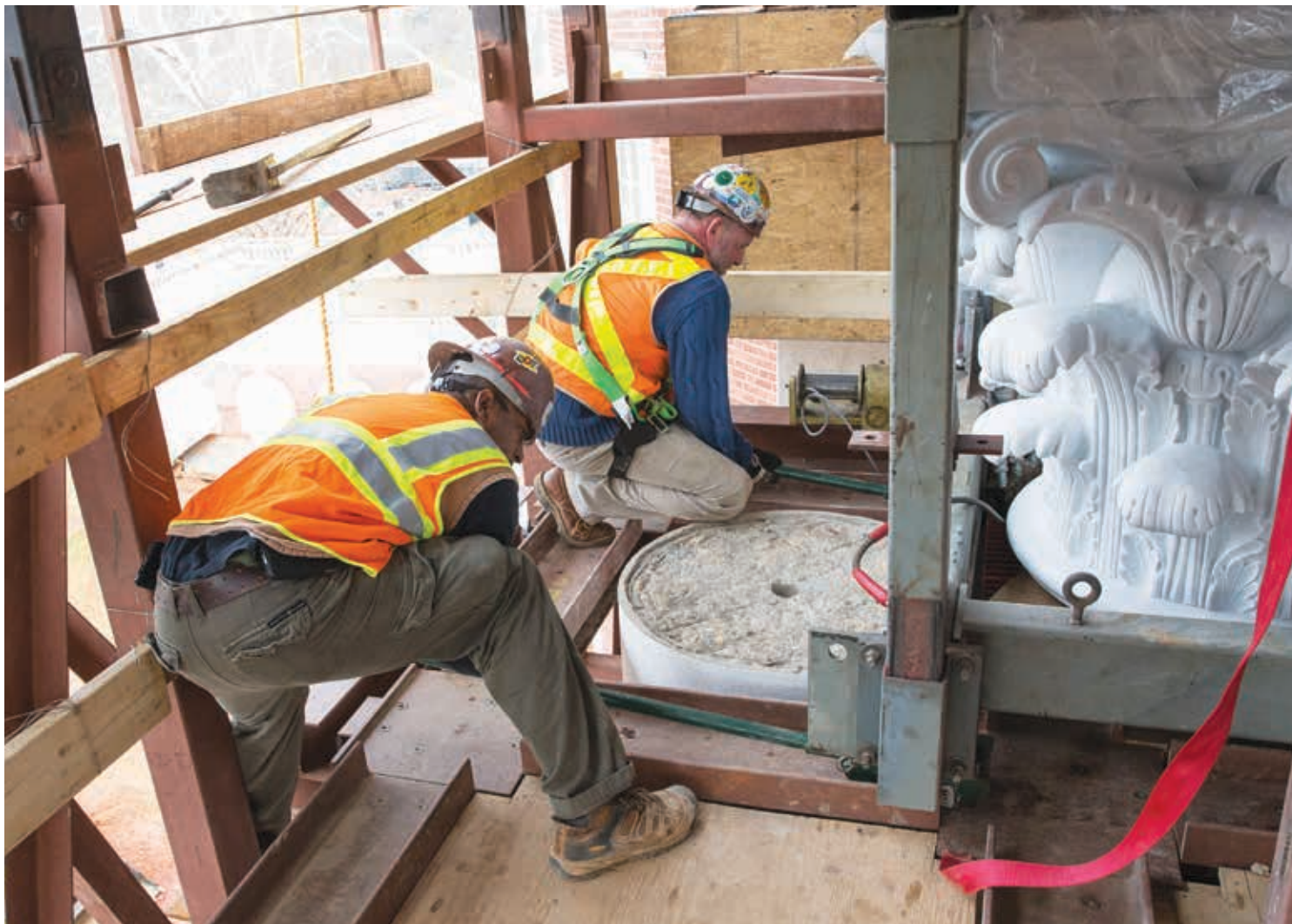
Since the height and width of the entry to the rotunda was limited, Rugo Stone created a lateral conveyance system to remove the existing capitals and replace them with the new ones.

really clear photographs from before the fire which we were able to enlarge. We then generated three-dimensional computer designs based on the photographs, field dimensions we took and fragments."