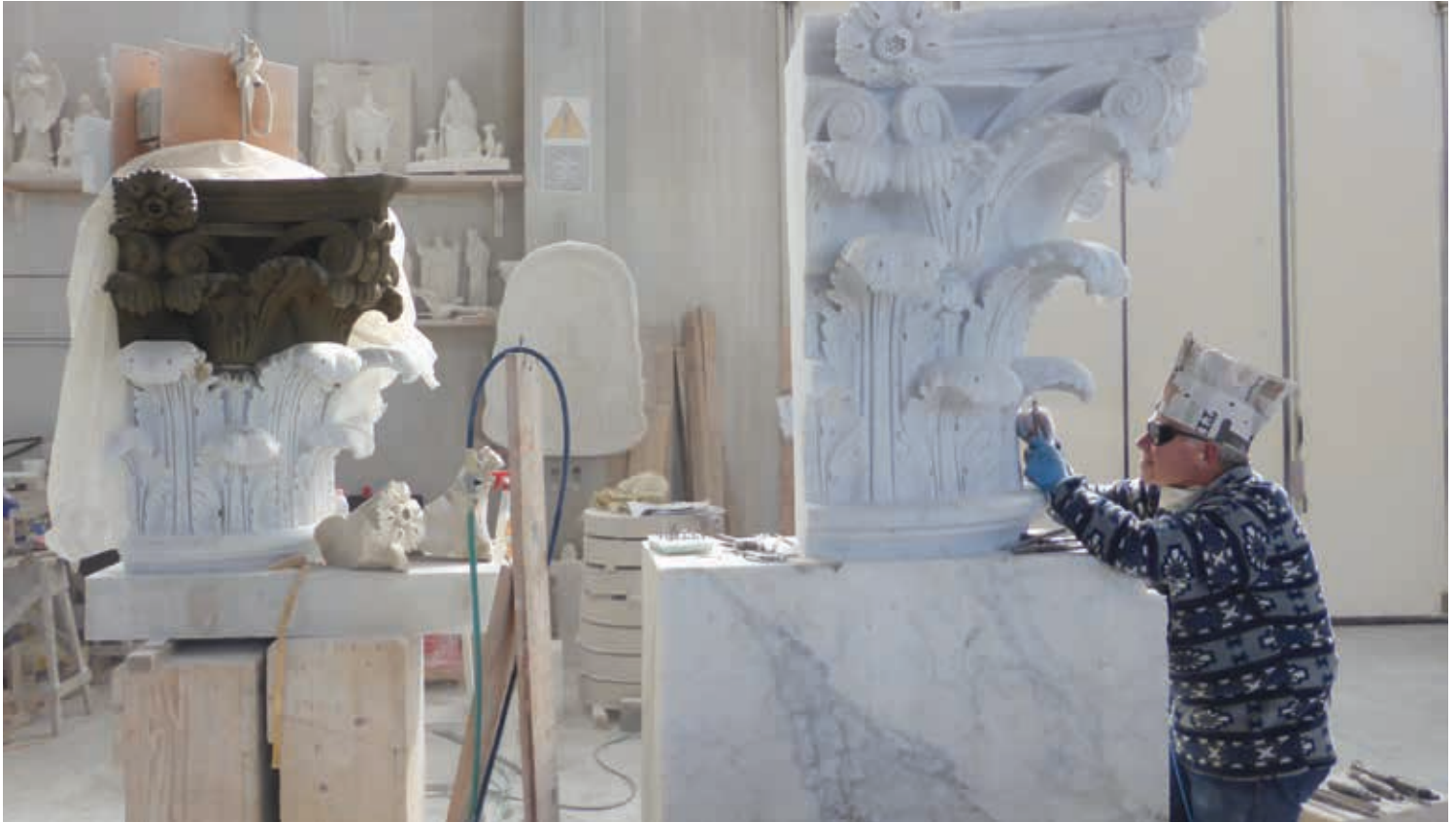
Once the prototype was tweaked and approved, professional sculptors at Pedrini srl in Carrara, Italy, created a full-size mock-up in the Carrara C marble from the Campanili Quarry.