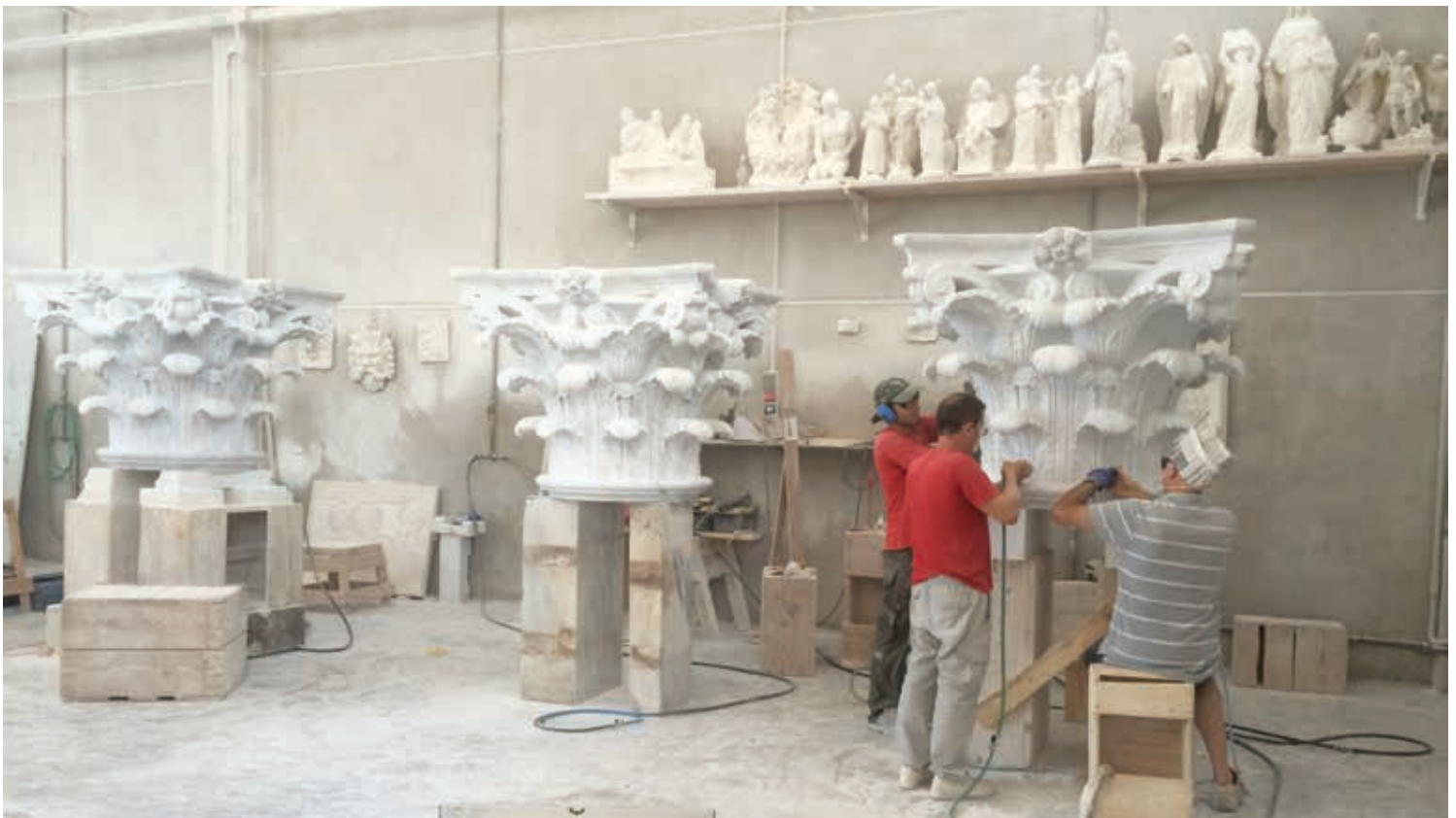
Several months were spent on the carving and creation of the 16 marble capitals, which were then carefully transported over to the UVA.