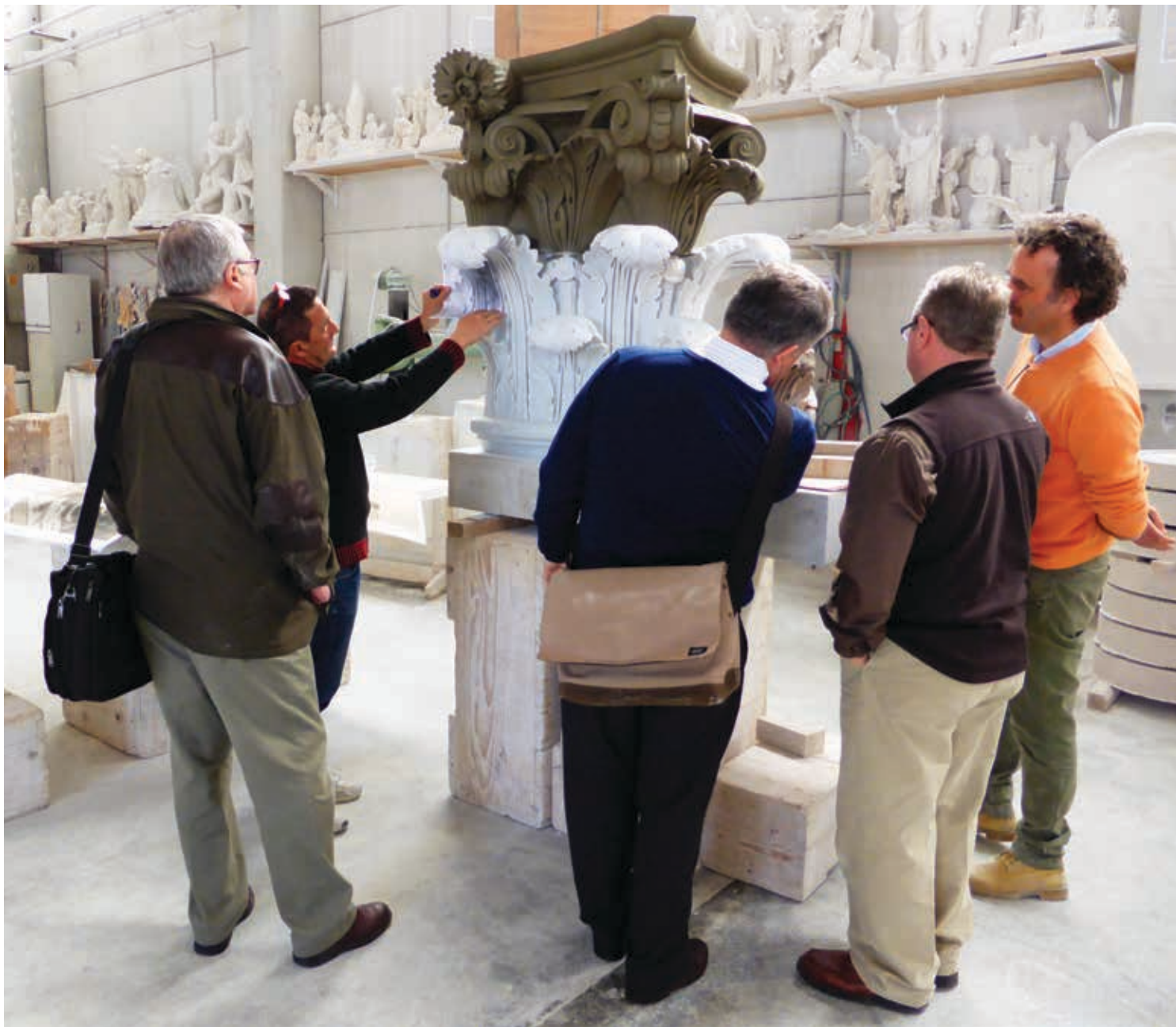
Representatives from Pedrini, Rugo Stone, JGWA and the UVA observe the completed prototype in Carrara, Italy. A couple of weeks were spent on each section of the capital, according to the architect. "The top was more critical because it projected more design elements," he said.

that Jefferson used in 1825," said Waite.