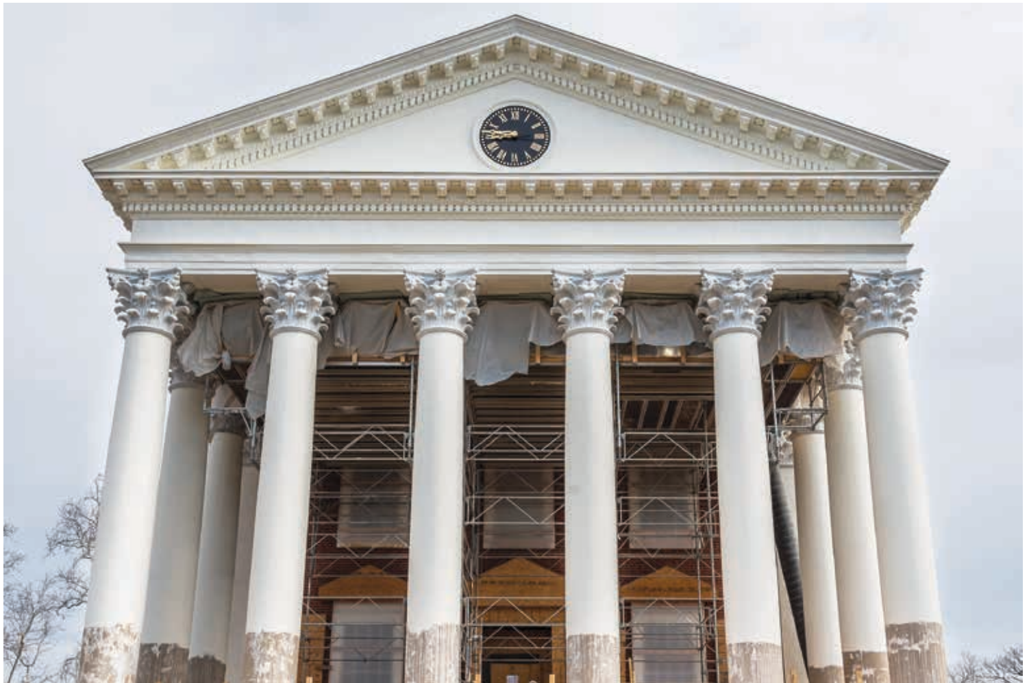
For the rehabilitation of the rotunda at the University of Virginia (UVA), which was completed in 2015, the main focus was replicating the marble capital columns that were incorporated into the original design from the early 1800s.